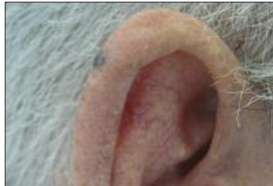
Figure 1. Purple papule on the ear.

A venous lake is an asymptomatic vascular ectasia/dilatation likely with vascular thrombosis exacerbated by sun damage. These papules present as dark blue-to-purple papules which are compressible and soft. Most commonly, they are noted on the lower lip and ears of the